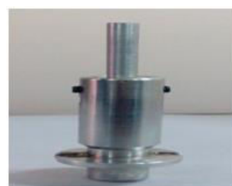
Pin attached with rigid adapter